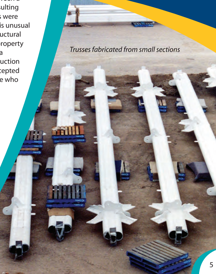
Trusses fabricated from small sections

“Getting technology into the market so that people are aware that there is another way...is what we’re all about.”