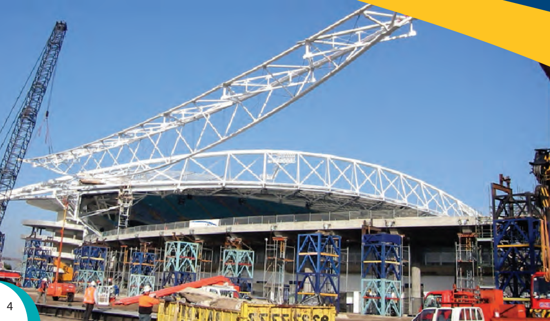
Catenary truss being craned into position

The roof has been compared to the shape of the brim of an "Akubra" hat and is widely accepted as an aesthetically pleasing solution to a difficult geometric problem. The client gave high importance to the new roof looking like a natural extension of the existing roof, and this is thought to have been achieved.